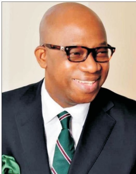
His Excellency, Prince Dapo Abiodun Executive Governor, Ogun State

the College Disciplinary Committee for appropriate punishment while their leader(s) will be suspended for 3 months.