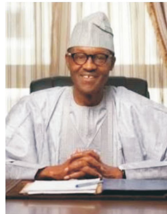
His Excellency, Muhammadu Buhari GCFR President, Commander in Chief of the Armed Forces Federal Republic of Nigeria